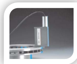
End face V-block measurement