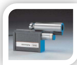
Upside down measurement